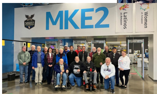
Photos from recent group outings